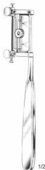
SILVER 02.186.00 19 cm