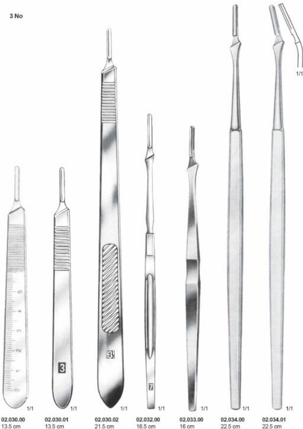
02.030.00 13.5 cm