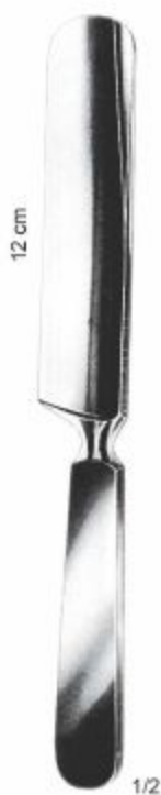
REHN 02.180.00 23.5 cm