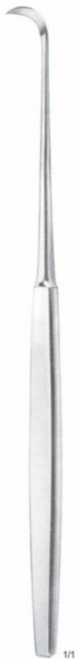
BRUNINGS 02.126.00 21.5 cm