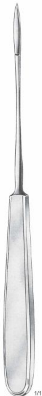
HALLE 02.120.00 21 cm